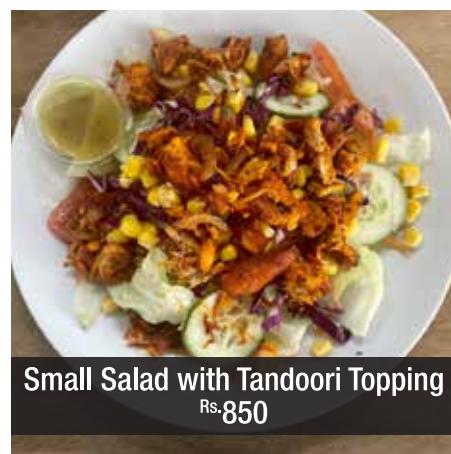
Small Salad with Tandoori Topping Rs. 850

Choice of dressings - honey, lemon or vinaigrette.